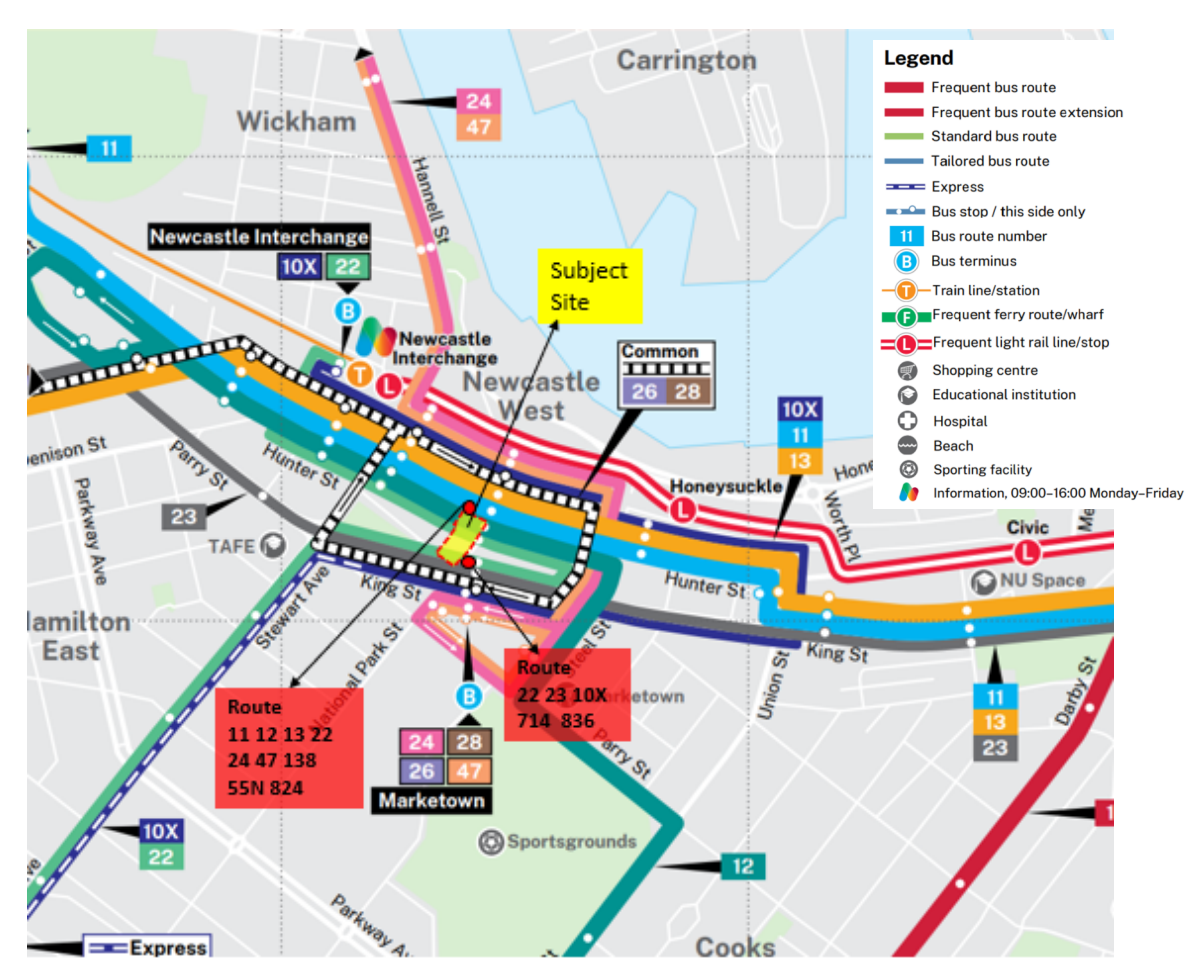
Figure 6 Newcastle Transport Network Map (NSW Government, 2022)

The development site has excellent access to all forms of public transport including light rail, bus services and ferry services. Figure 6 is an extract from the Newcastle Transport Network Map 2022 and illustrates the location of the site with respect to nearby public transport.