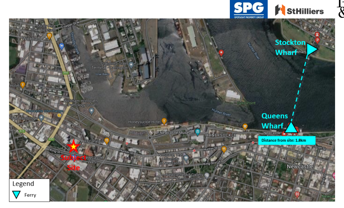
Figure 9 Newcastle Ferry Route