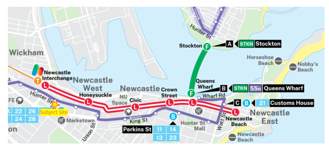
Figure 8 Newcastle Light Rail Route

The development of the light rail network in Newcastle provides convenient commuting throughout the CBD. Figure 8 illustrates all existing stations for the light rail services as well as the proximity of the proposed development to the current light rail network. Figure 7 above highlights the proximity to the light rail stop, which is 300m to the north. This is well within the comfortable walking catchment for public transport.