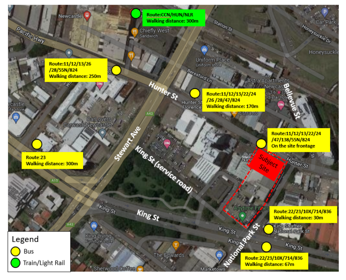
Figure 7: Nearby Public Transport Locations