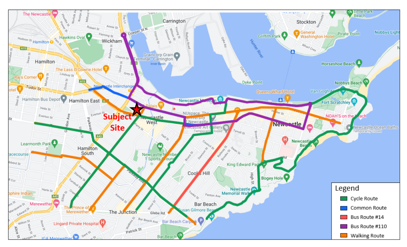
Figure 11 - Active Travel Map (UON, 2022)

Bicycle parking facilities, in the form of bicycle racks, are also available along the King Street Service Road and Hunter Street.