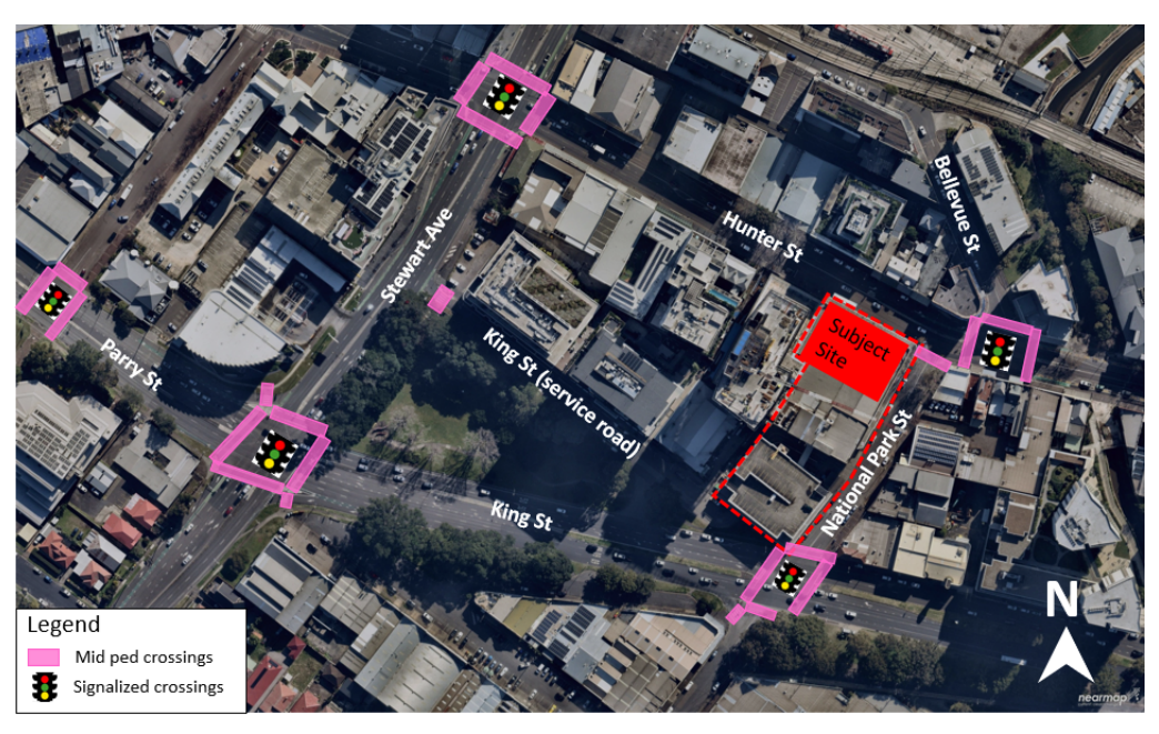
Figure 10: Signalised Intersections & Mid-block Pedestrain Crossings

Figure 10 illustrates the locations of the signalised intersections in the vicinity of the site and highlighted all midblock pedestrians crossing area.