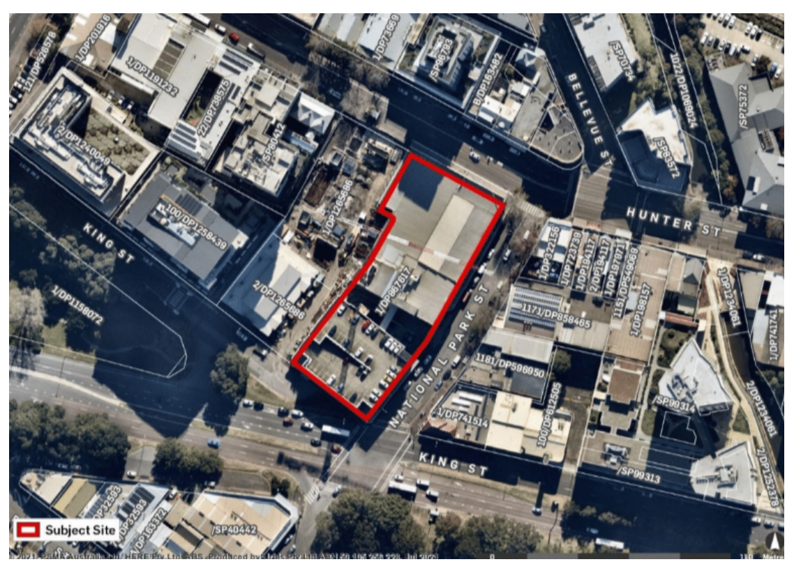
Figure 1 Site Location (Urbis, 2022)

Heritage Significance: Not identified as a heritage item but is adjoining an identified local heritage item to the south-west, namely the Army Drill Hall (I508) located at 498 King Street and is diagonally adjacent to the Bank Corner which is a locally listed heritage item located at 744 Hunter Street. The site is also located within the Newcastle City Centre Heritage Conservation Area