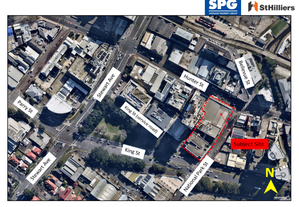
Figure 3 - Subject Site

The site currently has one vehicular access via National Park Street which leads to an off-street carpark. Figure 4 illustrates the existing vehicular access at the site.