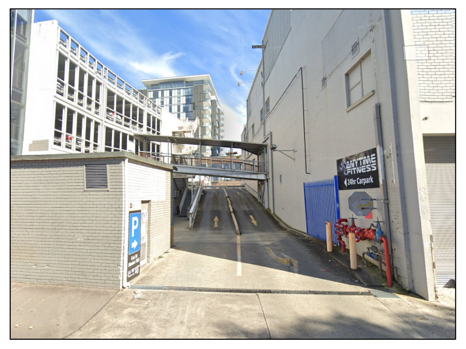
Figure 4 - Existing Vehicular Access via National Park Street

The site currently has one vehicular access via National Park Street which leads to an off-street carpark. Figure 4 illustrates the existing vehicular access at the site.