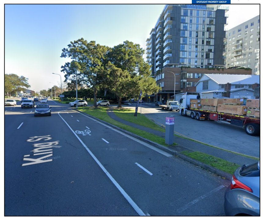
Figure 12 - On-Road Bike Lane Along King Street (Google Maps, 2022)