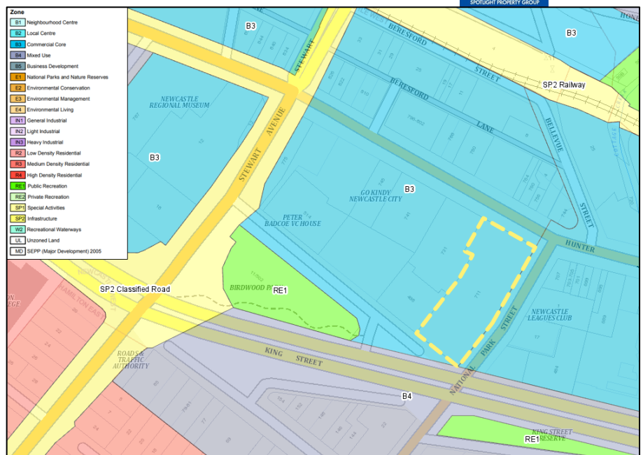
Figure 5 - Planning Scheme Zones (NSW Government, 2022)